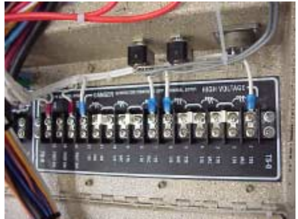
Check the wire markers on terminal strip TS-0 locations: 1, 6, 7, 12, 13 & 15. Re-tag the wire locations if necessary.