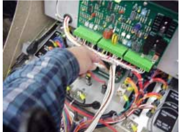
Unplug the Audio Alarm connector.